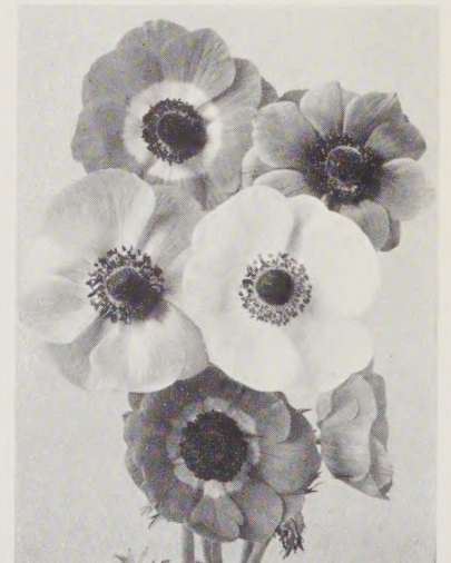
DE CAEN ANEMONES

Large bulbs: Per doz. 85c, per 100 $6.00